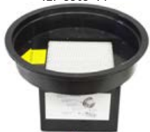
Polyester Prefilter 128-7504-14