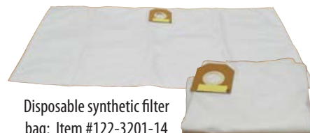
Disposable synthetic filter bag: Item #122-3201-14

The HEPA filter is individually tested and certified to be 99.97% efficient at .3 microns according to IEST-RP-CC001 test requirement.