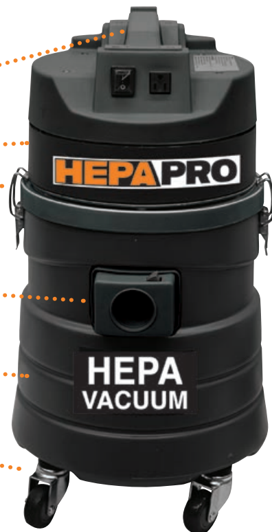
HEPA Filter Assembly 127-3305-14

Four swivel casters: Superior mobility even with a full tank of water.